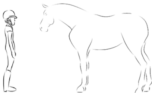
CALM DEFAULT - FRONT

From either side of the equine, the handler should stand still (vocal or stationary body language cues permitted). The equine should stand calmly and patiently with their head forward or away from the handler, ideally with a low headset (poll below the wither)